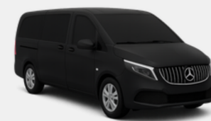
First Class MPV