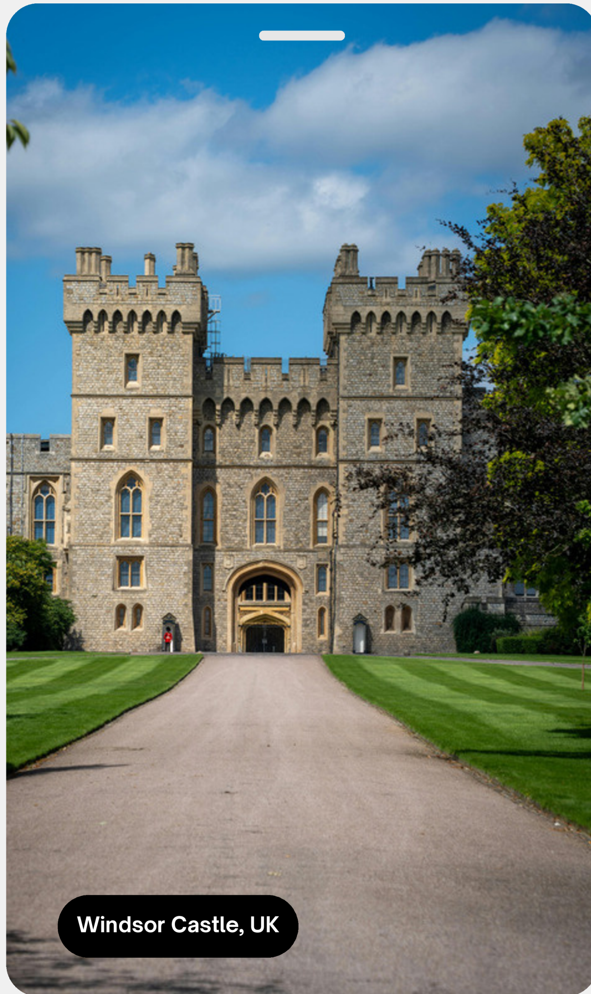
Windsor Castle, UK