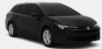
Cars & Sedans

Choose from a modern, fully licensed fleet