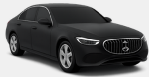
First Class Car