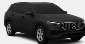
SUV & MPV