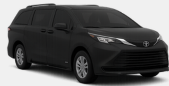
SUV & MPV