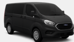
8 Seater minibus