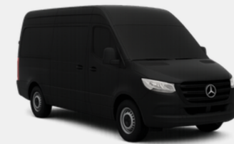
16 seater minibus