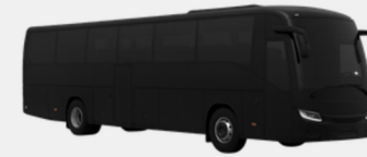
52 seater coach